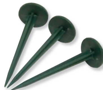
Green Fabric Pins

Re-pins™ are the ideal anchors for temporary coverings such as DeWitt Plant and Seed Guard, Overwinterized fabrics and N-Sulate cold weather plant protector. These nonpermanent stakes are easy to install and remove. Re-pins™ are UV-treated with highly visible red plastic and durable enough for hundreds of uses.