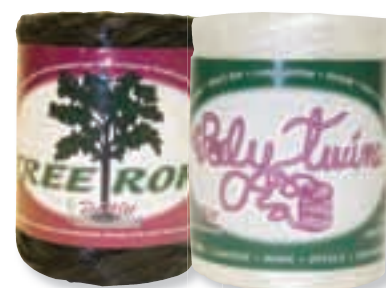
Tree Rope & Poly Twine